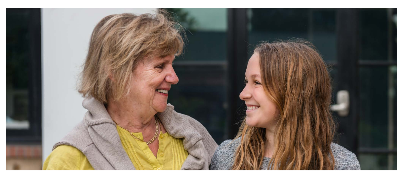
Images are for illustrative purposes only and while generally typical, minor variations may apply. Furniture is not included

Live at Golden Rise and discover a new home, caring community and a whole new outlook on life.