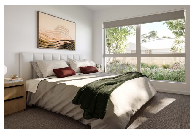
Images are for illustrative purposes only and while generally typical, minor variations may apply. Furniture is not included